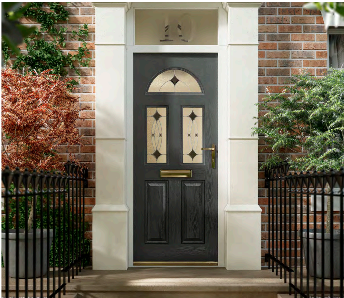
Eclat Door with Lunna Glass

Decorative triple glazed panel with contrasting grey glass bevels and zinc comes encapsulated between two clear panes. The curved diamond design creates a distinctive look and feel that attracts attention.